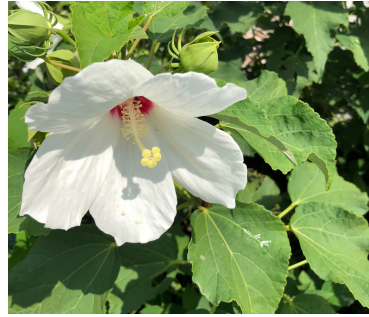
Crimson-eyed Rose Mallow