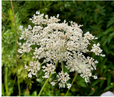
Queen Anne's Lace

A sampler of wildflowers found at Borough Hall, the PIP State Line Lookout, and Alpine backyards. Take a look around town and see what YOU find.