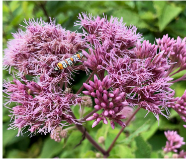
Joe Pye Weed